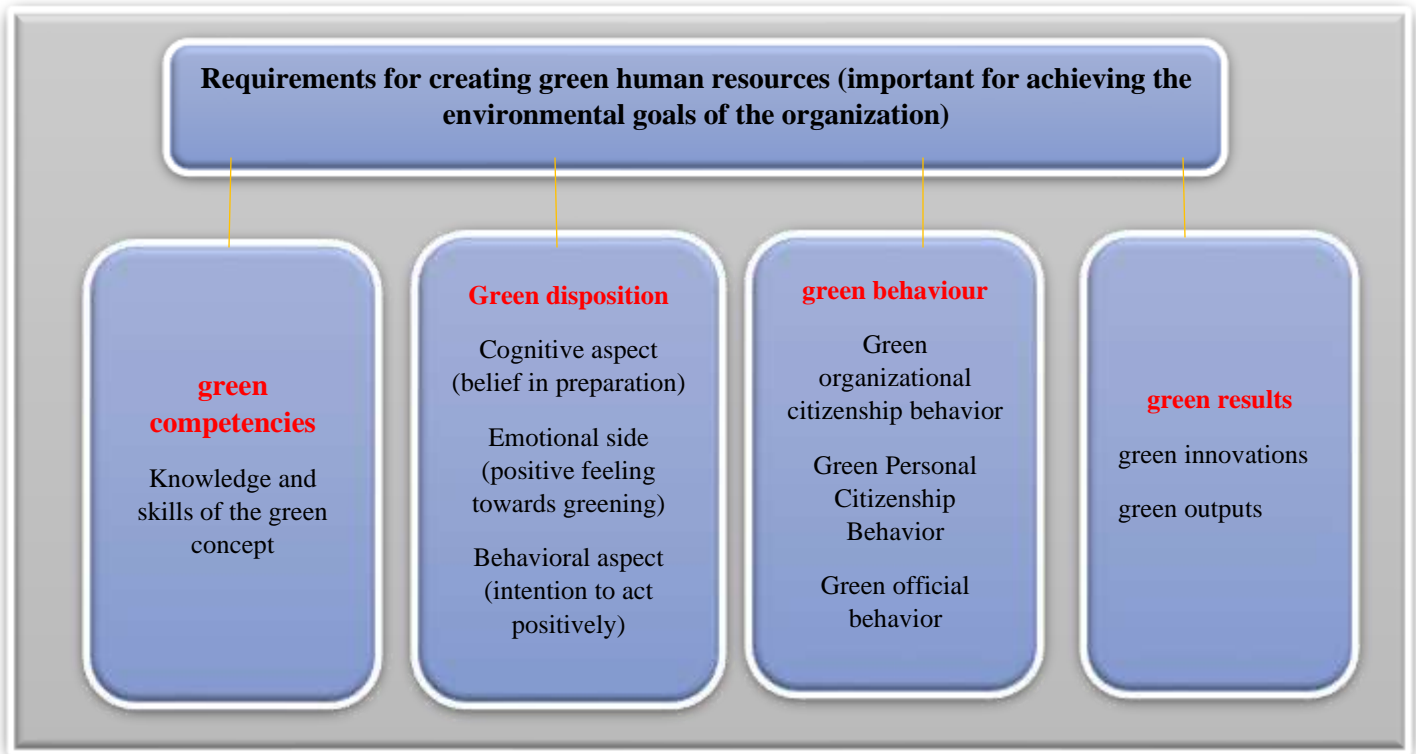
Figure (2) Requirements for creating green human resources

Source: Opatha, H. H. P., & Arulrajah, A. A. (2014). Green human resource management: Simplified general reflections. International Business Research, 7(8),p 101.