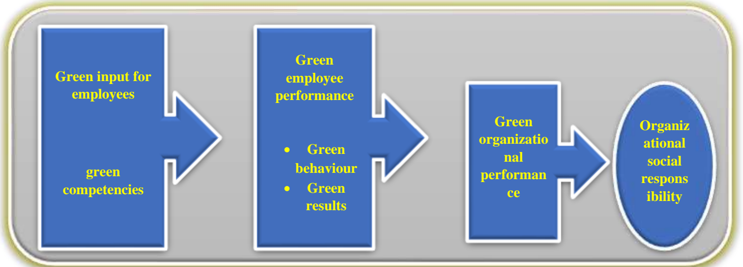
Figure (3) Green employee input and green employee performance of the job

Here, green competencies and green behavior are seen as inputs for the green employee, and green behavior and green results are seen as green performance for the employee, which contributes to the organizational performance that achieves the social responsibility of organizations to a large extent, which is illustrated in the following figure: